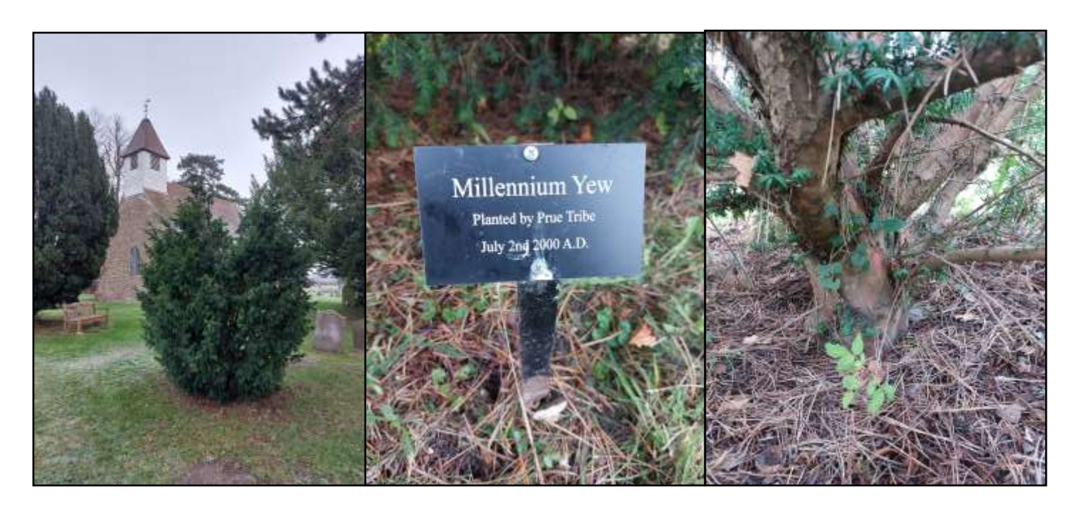
Yew 2 grows 24' SW of the church. Girth 3m 30cm (10' 10") at the ground.

Yew 1 is a millennium yew growing 22' south of the church. Girth was 54cm (1' 9") at the ground.