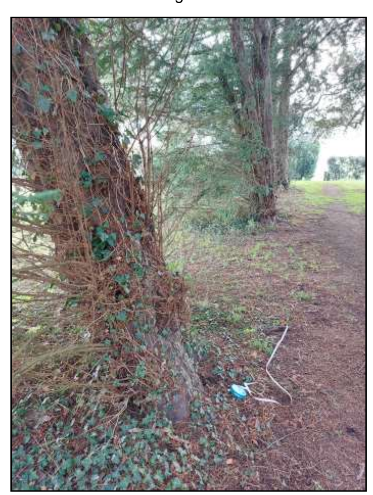
All of the trees, apart from the millennium yew, form an avenue leading from the public footpath in the fields to the south porch of the church.