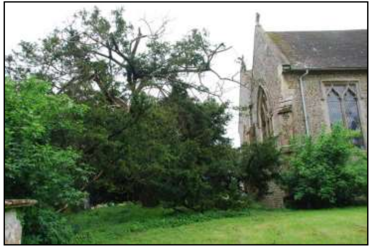
© Tim Hills/Peter Norton - Ancient Yew Group - 2019