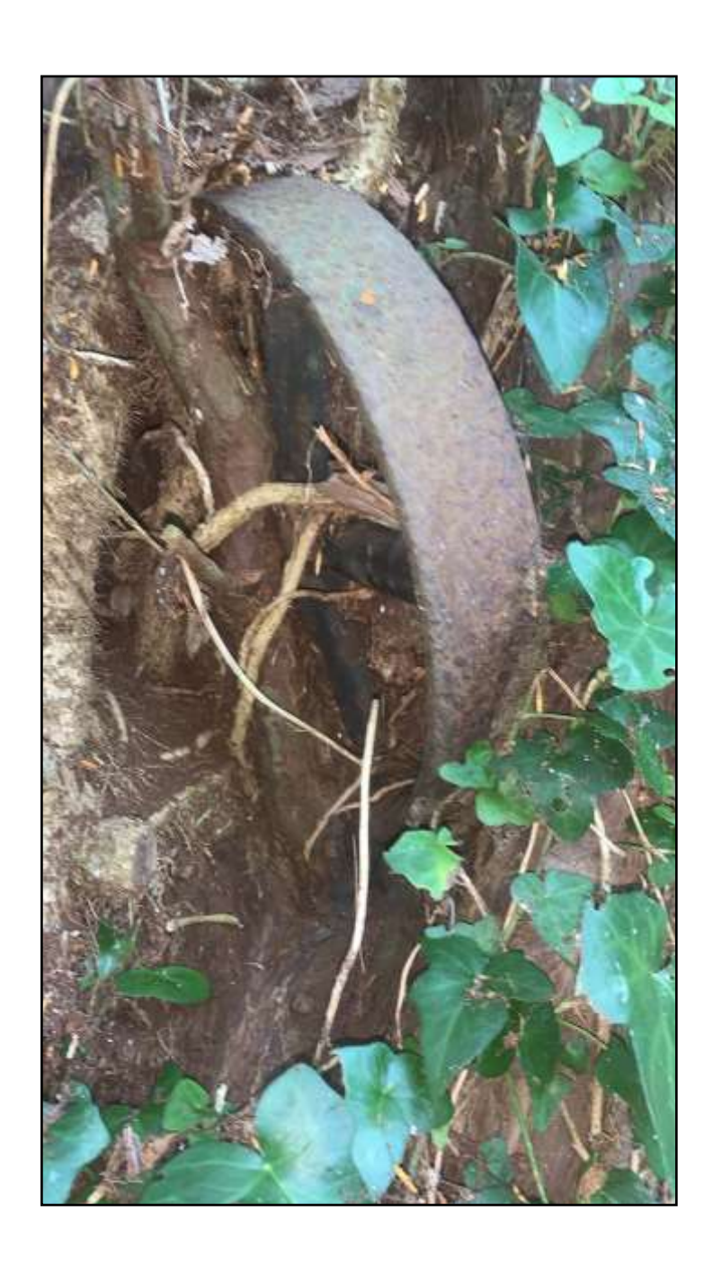
© Brynley Andrews Arboriculturist / urban forester 27/07/2022