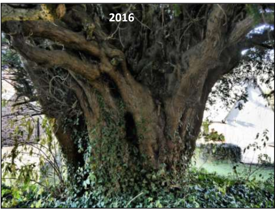
In 2016 three younger yews were recorded, each one incorporated into rough hedges on the western perimeter of the churchyard.