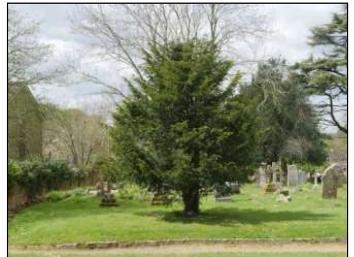
Yew 2, above right, is young and consists of 3 upright stems from close to the ground.

Yew 3 is male and grows towards the western end of the churchyard, about 50m from the tower. It consists of many upright stems on an elongated bole with a girth of about 9'.