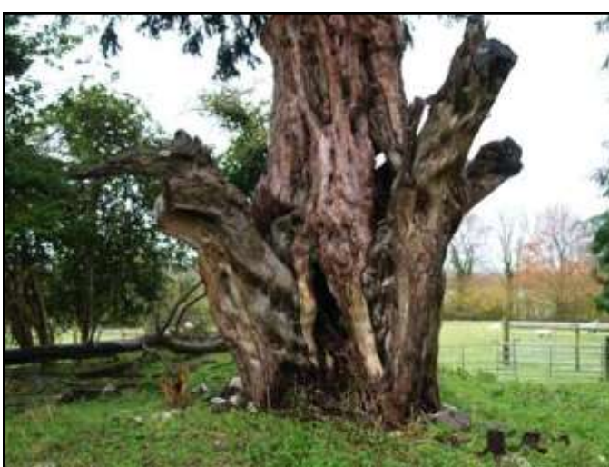
© Tim Hills - Ancient Yew Group - 2019