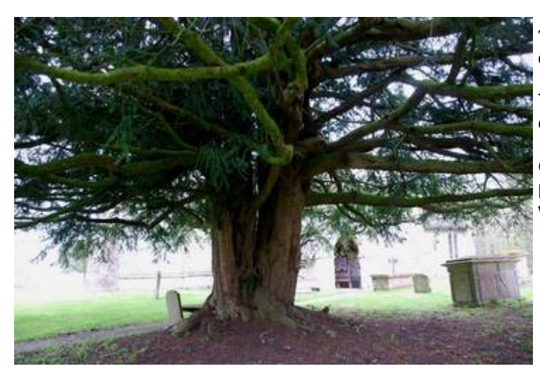
North Newnton - St James - SU1357

The first church on this site was built in 963, making it one of the oldest in the country.