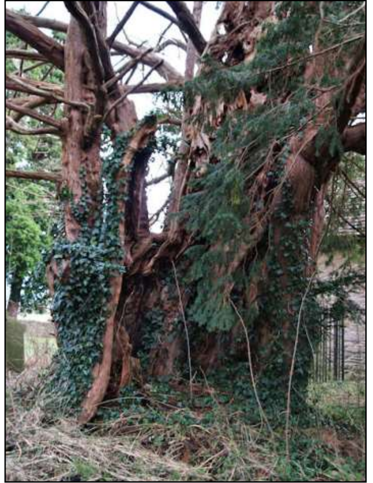
This yew has been planted to replace the irreplaceable.