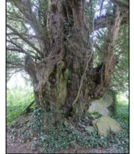
© Tim Hills - Ancient Yew Group - 2020