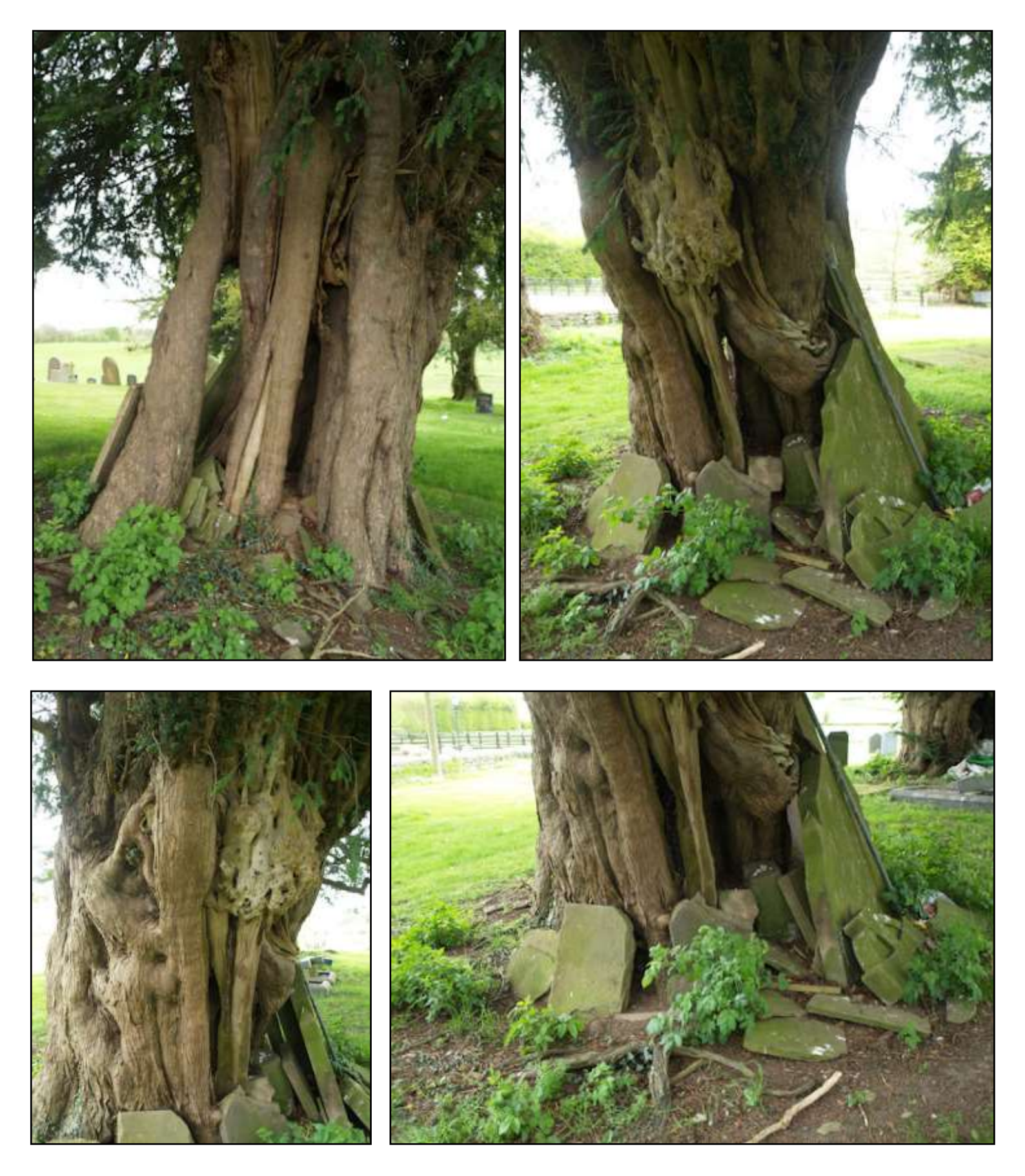
© Tim Hills - Ancient Yew Group - 2020