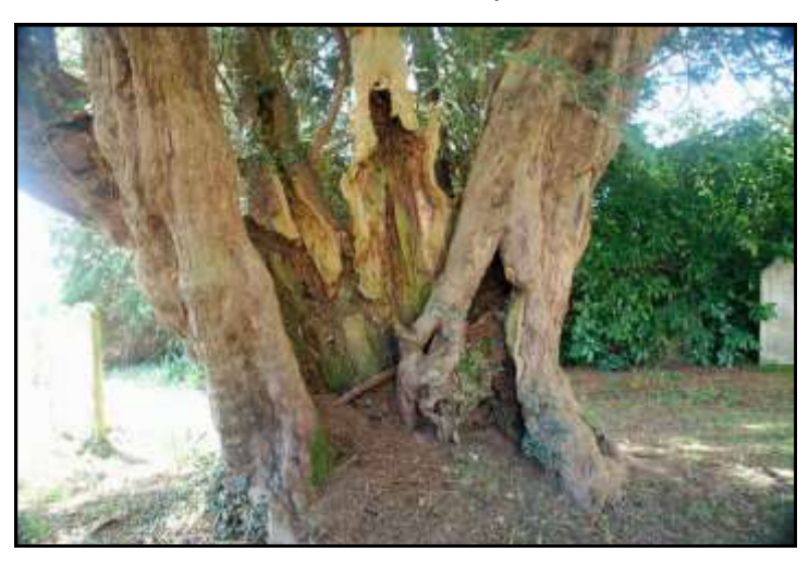
The photos below were taken by Peter Norton in 2013