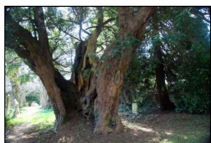
He also recorded a further three yews, a female, girthing 8' 11" on the south perimeter, and two young yews at the northwest corner of the church.