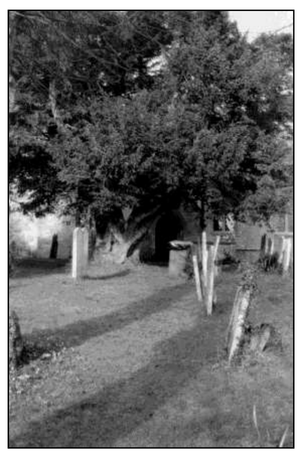
The B/W photos were sent to the Conservation Foundation as part of their 1987 Yew Tree Campaign in conjunction with Country Living magazine.