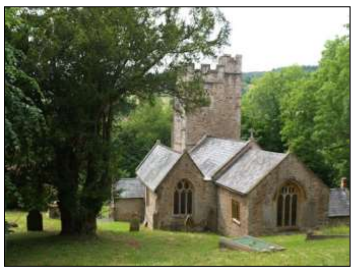
Trees 2, 3 and 4 grow on the east perimeter at the top of a slope alongside other trees. Each has had many branches removed. Tree 2 girthed about 4', tree 3 was 5' 10" and tree 4 about 7'.