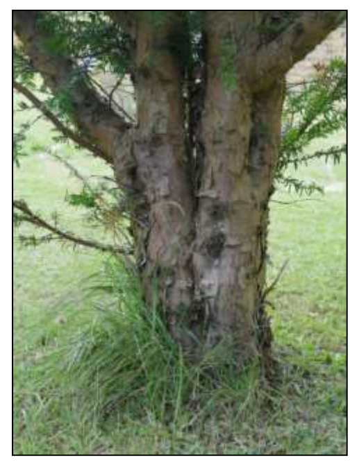
The yew centre and right is closest to the church building on the north side and had a girth of 2' 5\frac{1}{2} " at 3". It divides into several stems at a height of about 15".

ASHCOTT All Saints ST43723715 5<sup>th</sup> November 2012