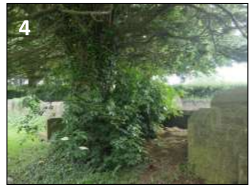
Six yews grow here

Tree 1 is NW of the church on the perimeter among many lime trees. It is many stemmed with a girth of about 7'.