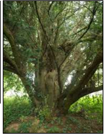
Five yews grow here.

Yew 1 (left) is female at the east end perimeter wall. It is multi stemmed and also has new shoots appearing nearby that clearly grow from the same root stock. Estimated girth was about 8'.