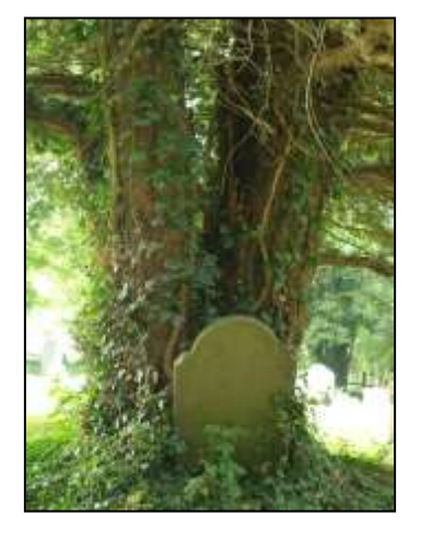
Tree 3 develops two trunks from a height of about 2' 6". Girth around these was 13'/14'. Yew 4 becomes multi branched from close to the ground. Its girth was 8' 7" above its roots. Yew 5, measuring 7' 3" around its base consists of three trunks. Its foliage was poor. Yew 6 is leaning and ivy clad.