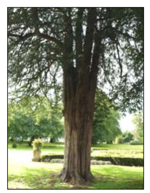
There are also many yew hedges here.