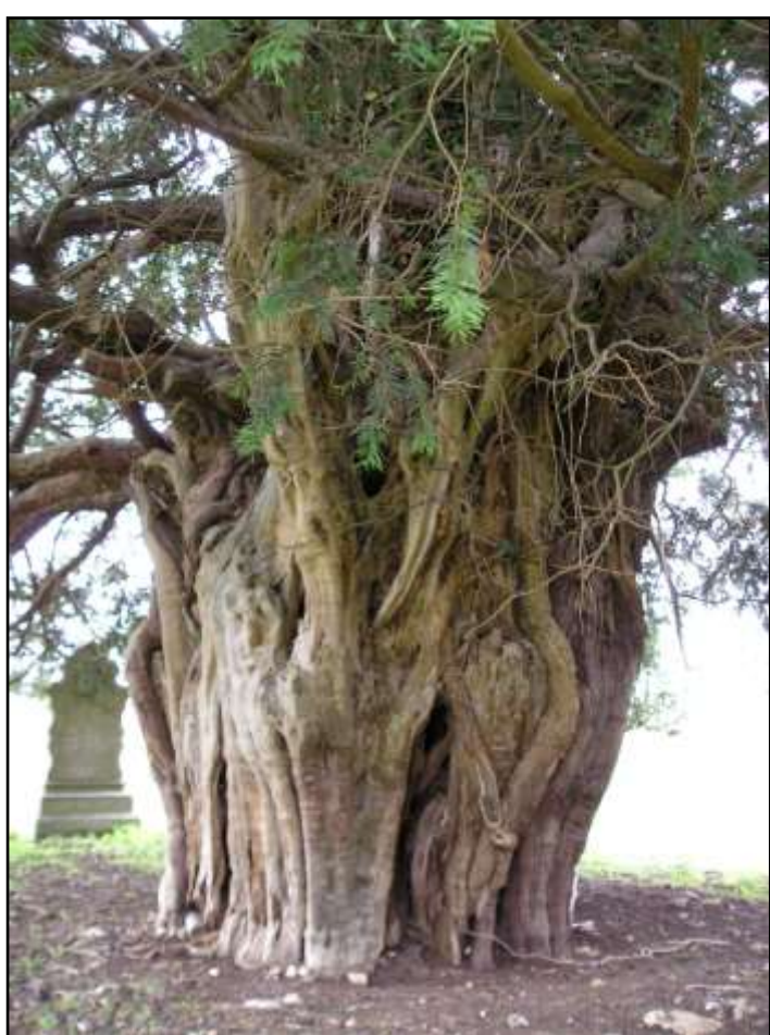
A hollow male northeast of the church measuring 14' 5" at 1'. It had epicormic growth covering most of its bole from the ground to 5'. Pieces of the original central trunk were visible.