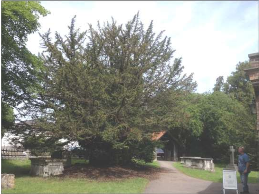
Ivy removal on a small tree